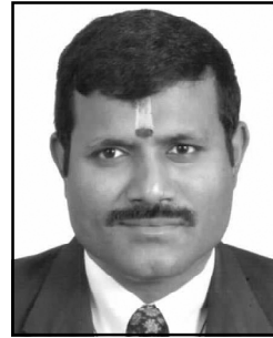
CA. VIJAY ANAND

In RE: Switching Avo Electro Power Ltd. 2018 (13) GSTL 84 (A.A.R.-GST), the applicant is a supplier of power solutions, including UPS, servo stabiliser, batteries etc. wants a ruling on the classification of the supply when it supplies UPS along with the battery and specifically wants a ruling on whether such supplies can be treated as composite supply. The authority observed as under: